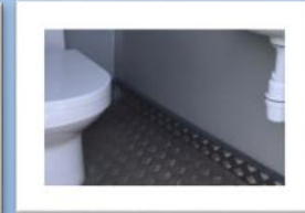
ALUMINIUM CHEQUERED PLATE FLOORING

The use of durable featuring a steel base , high-quality aluminium chequered plate for flooring , stainless steel to built the water and waste holding tank to ensure to make this cabin toilet extremely durable.