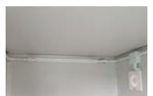
2' FLUORESCENT LED LIGHT