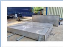
STAINLESS STEEL WATER TANK (1500L)