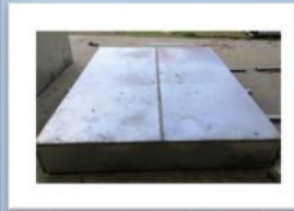
STAINLESS STEEL WASTE HOLDING TANK (2600L)

The most basic but complete toilet facilities design of 4 cubicle rooms cabin toilet with flush system , build in water tank and waste holding tank that can be assembled with bolts and screws rather than welding on-site.