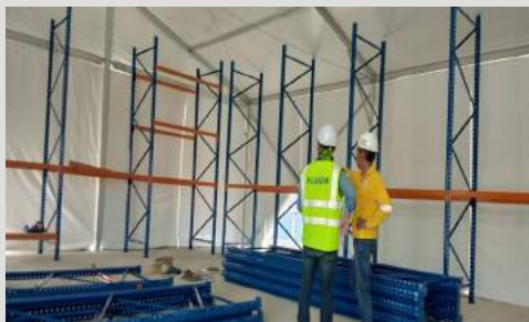
Optional : To supply racking system